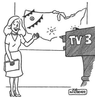
AND SUNDAY LOOKS LIKE A LOVELY DAY TO FORSAKE NOT THE ASSEMBLING OF YOURSELVES TOGETHER.

Christian Sisters provided goody bags, desserts and served meals and drinks for the Mutual Aid Convention on July 13. The next meeting will be August 20 at 11:30 am.